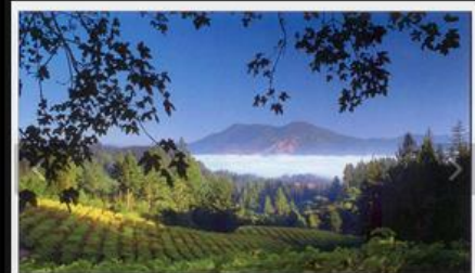
Napa Valley "Good wine is inspiring and adds greatly to the joy of living." THOMAS JEFFERSON (1743-1826)