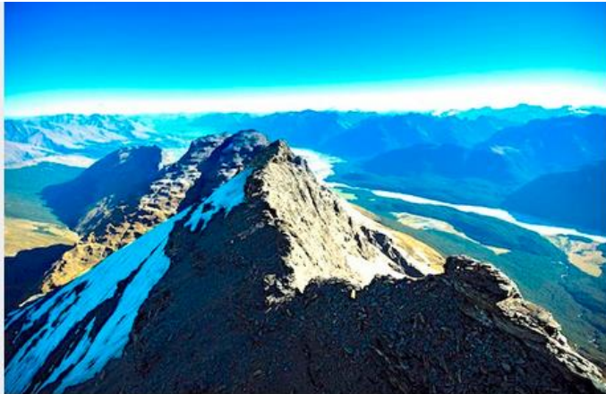
New Zealand's Misty Mountains.

As if these activities aren't enough reason to get your LOTR fix in New Zealand, Zicasso's LOTR tour includes many other adventures including a tour of Miramar, a walking gourmet tour of Wellington, and a cruise across Lake Manapouri. So, you'll get to experience the natural beauty of New Zealand while immersing yourself in Middle Earth, making the Zicasso tour the one tour to rule them all.