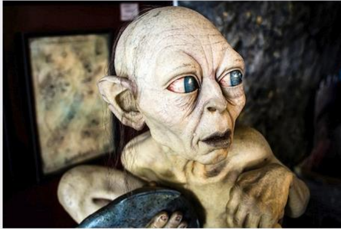
Gollum Figurine at Weta Workshop.

Another tour highlight is an hour inside the Weta Workshop, where artists conceptualized the creatures and all the props. A beady-eyed wax figurine of Gollum and a friendly staff member meet you at the entrance. Fortunately, your journey continues only with the staff member who will show you the ins and outs of this creative studio. Get up close and personal with wax figures of the most fearsome creatures.