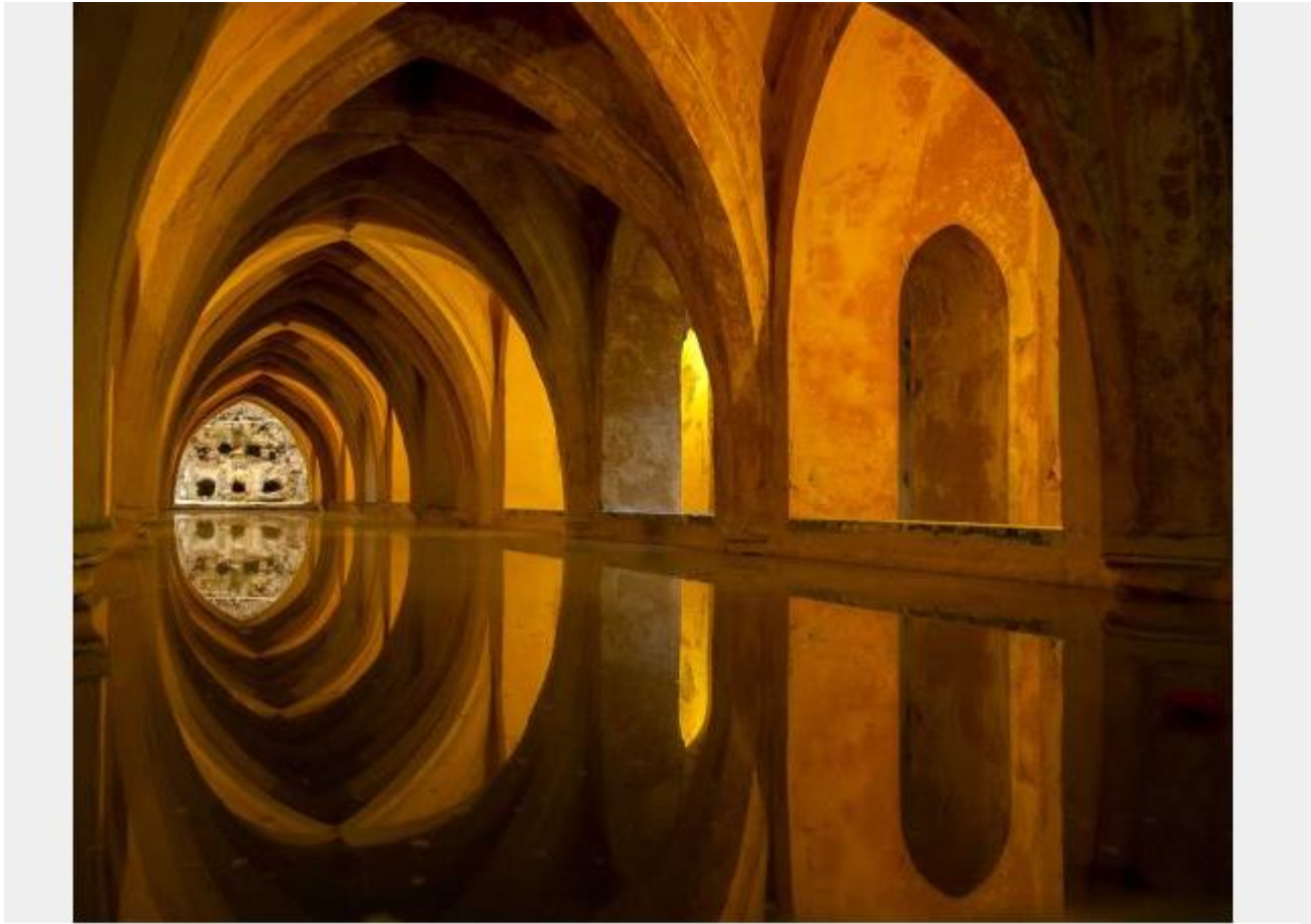
"Game of Thrones" character Ellaria Sand will have an important confrontation in the baths at the Royal Alcazar in Seville, one of the sites on a new Zicasso tour of Spain inspired by the series.