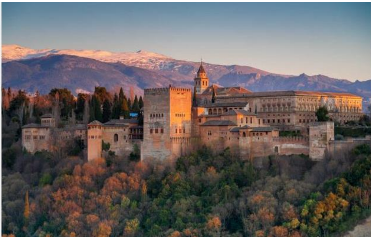
The Alhambra in the Andalusian city of Granada is one stop on Zicasso's new tour of Spain, inspired by Season 5 of "Game of Thrones."