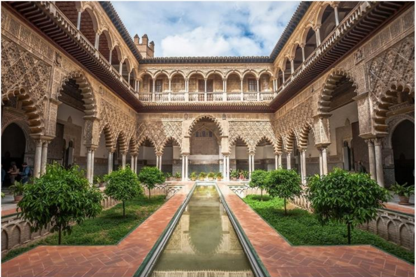
The courtyards of Alcázar which will serve as the Water Palace of Sunspear

Luxury travel referral service Zicasso is offering tours through southern Spain to see the palaces, views, and vistas that will stand in for the kingdom of Dorne. The tour starts with sightseeing in Madrid before heading south to Andalusia, where travelers will enjoy the old-world architecture of the capital city of Seville. It is here where Game of Thrones fans will get to tour the world-famous Alcázar, the oldest royal palace still in service in Europe. The lush gardens and courtyards of Alcázar will serve as the Water Palace of Sunspear, the royal residence of the House of Martell.