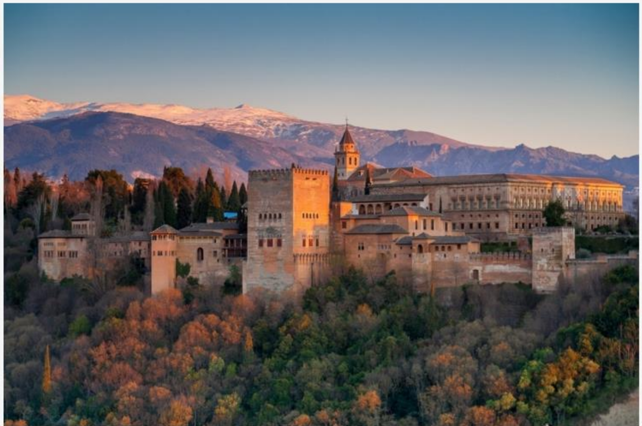
The Alhambra in Granada, Spain

Is there a show on television with as much scenic eye-candy as HBO's Game of Thrones ? The hit fantasy drama may be the most cinematic series ever made, with the show's devious characters flying their banners in some of the most picturesque settings on earth. Now that much of the action of the series is shifting to Dorne, a Latin-inspired kingdom on the southern end of the fictional Westeros continent, much of season 5 of Game of Thrones was shot in some of Spain's most beautiful and culturally-significant locales. Diehard fans of the series will now get a chance to visit the Spanish shooting locations that will be featured in the upcoming fifth season of the series.