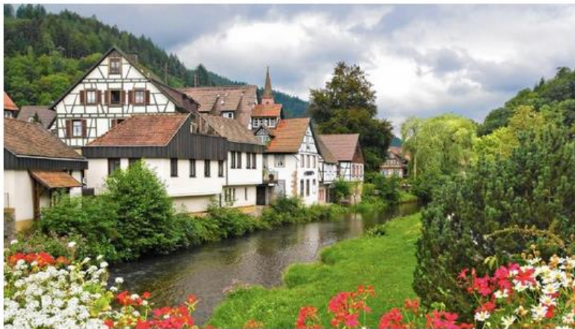
The town of Schillach in the Black Forest is on the food-trip itinerary.