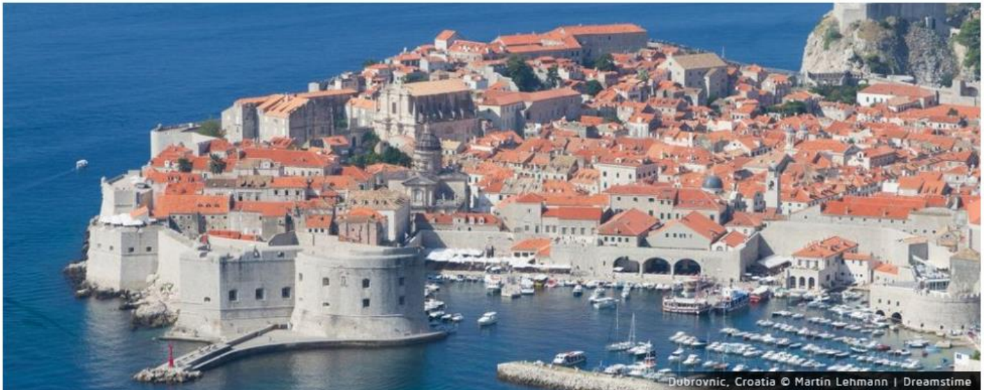
Dubrovnik, Croatia